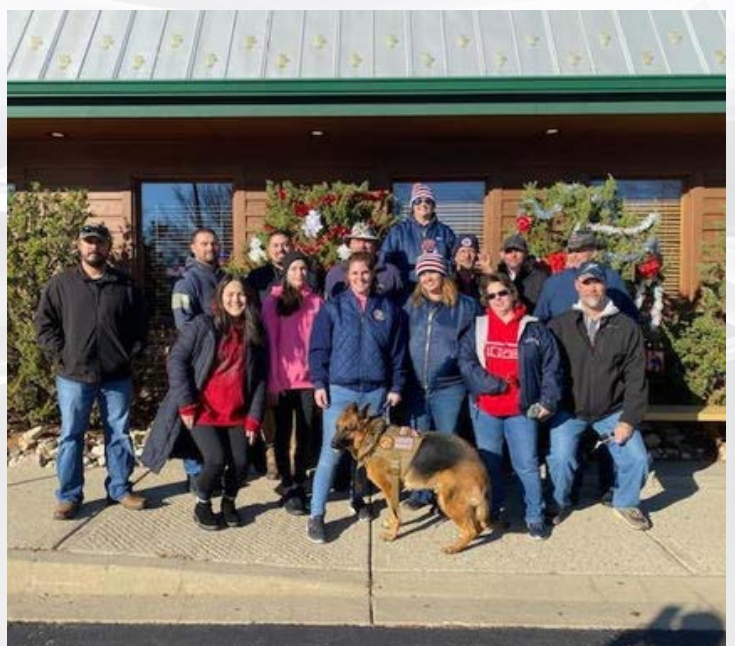
Supporting veterans on Veterans Day 2022 with Texas Roadhouse and Road Home!