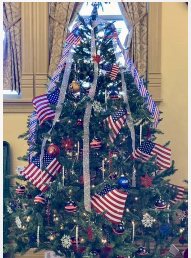
Decorated our company Christmas Tree at Woodstock Opera House!