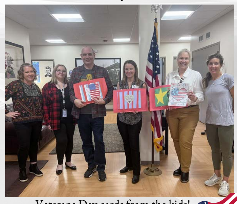
Veterans Day cards from the kids!