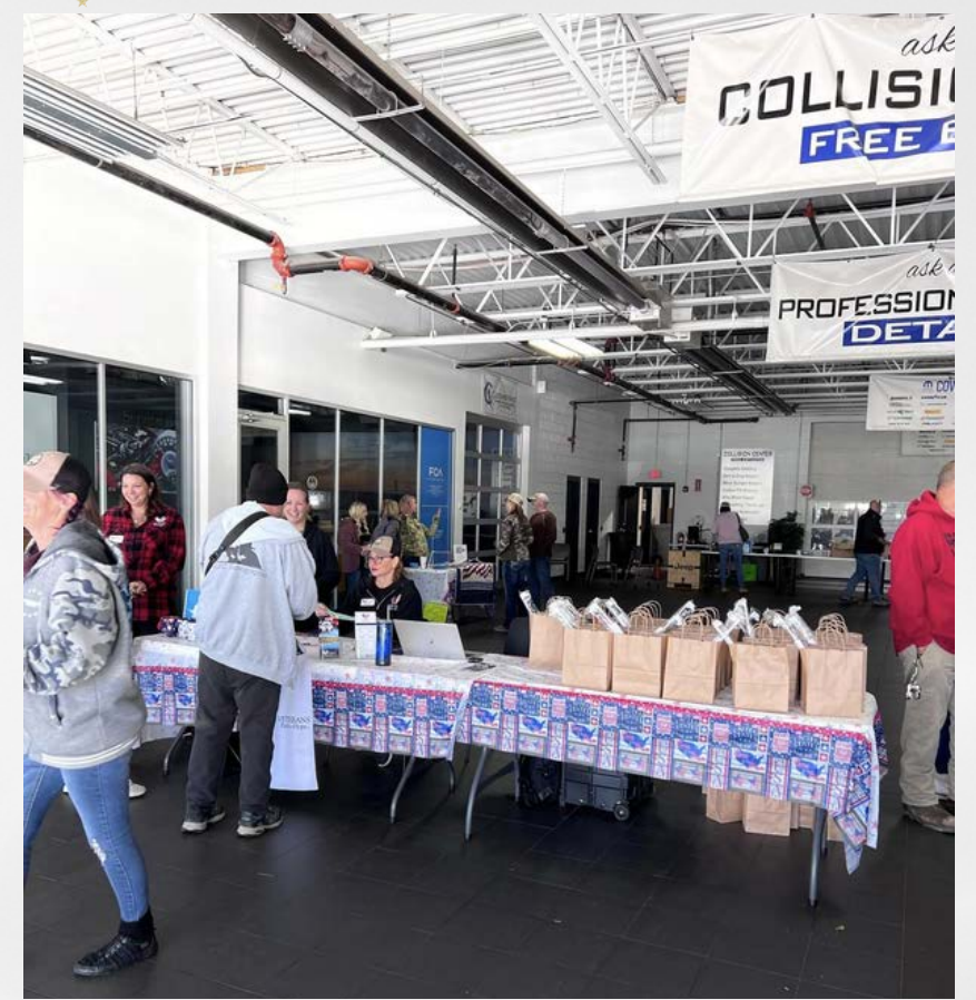
Had a successful Veterans Day Jeep Run with Jeep4Vets!